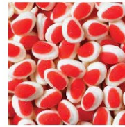
Strawberries & Cream